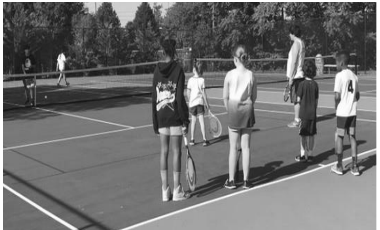
Babylon Village campers develop tennis skills at the Village Summer Recreation Program.

Registration will be online for convenience and more information will be coming soon! "Ice Pop Days, Crazy Sock Days and Camper of the Week" will be happening and we're proud to present plenty of summer programs for our children to enjoy!