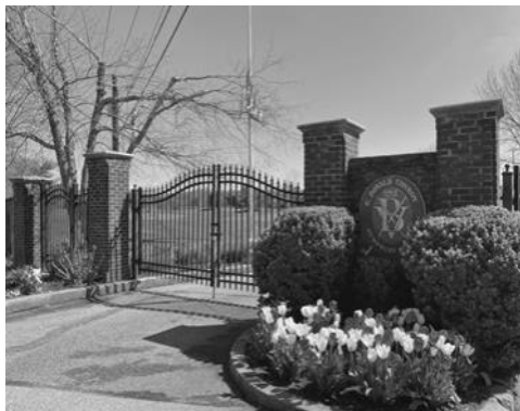
The E. Donald Conroy Golf Course at Sumpwams Creek opened for the 2021 season on Monday, March 29th.