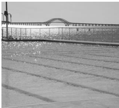
The beautiful Gilbert C. Hanse Pool will open for the 2021 season on Friday, June 25th.