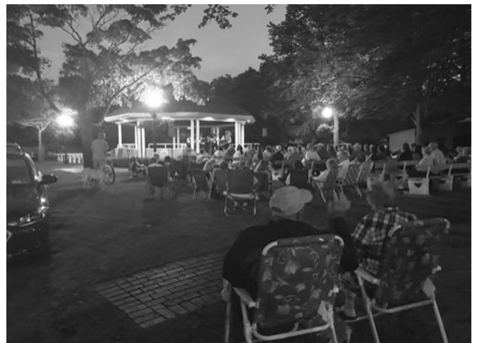
Babylon Village residents enjoying a concert under the stars at the Village Gazebo. The 2021 Summer Concert Series begins Friday, July 2nd.

Check the Village website and social media pages for upcoming community bike rides planned for the Spring.